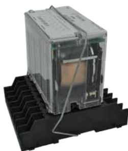
› E** retaining clips

Our front and rear sockets can be equipped with retaining clips. E0 is universal - compatible with all of our references. Metallic retaining clips references are available to fit the size of each relay.