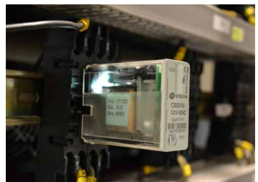
› Heavy duty trip relay during endurance test