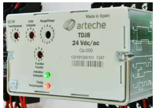
› Faceplate detail of a working TDJ8 relay