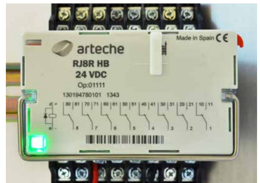
› A self reset tripping relay during operation