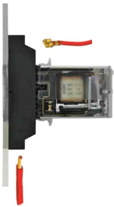
› Front connection socket