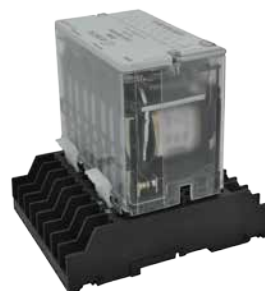
› E0 retaining clips