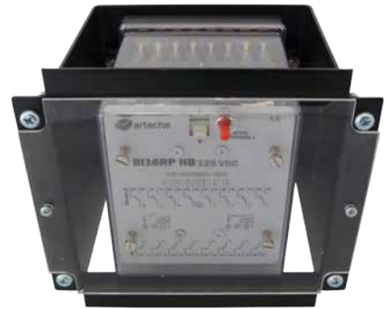
› BI16RP HB 125 VDC (I-EMP socket)